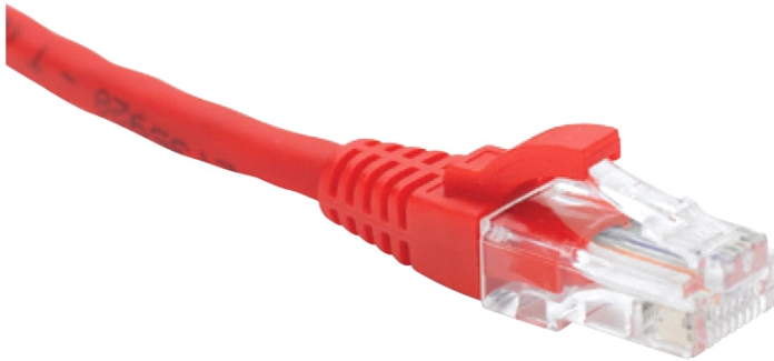
Image shows booted lead