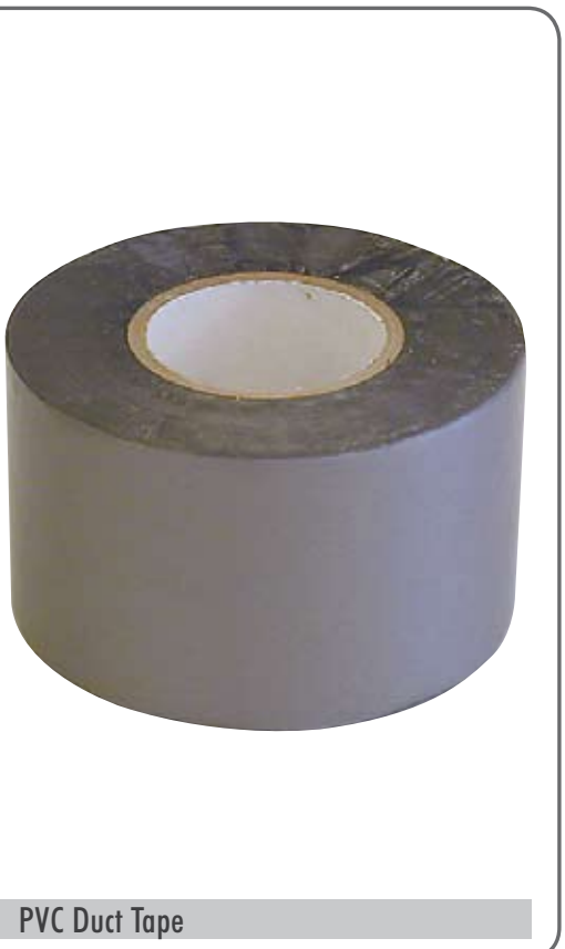
PVC Duct Tape