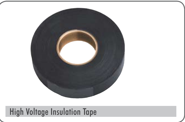
High Voltage Insulation Tape