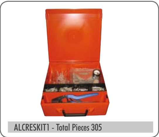
ALCRESKIT1 - Total Pieces 305