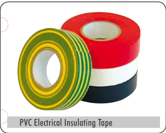
PVC Electrical Insulating Tape