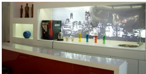
WHITE LED SYSTEM TOPOLOGY FOR DIMMING

Note: when dimming is not required each strip is supplied directly from the PSU. No controllers or amplifiers needed. Max strip lengths and PSU power limits must be observed