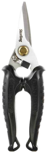
Black Panther 185mm Industrial Snip Part No: 06488482