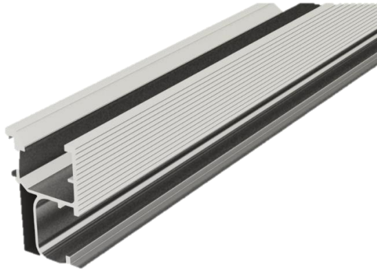
ECO Rail Part No.: ER-R-ECO/XXXX