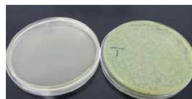
Challenge with 108cfu/ml P.a. (ATCC No. 15442) Swabbing (16 hrs. after contamination)